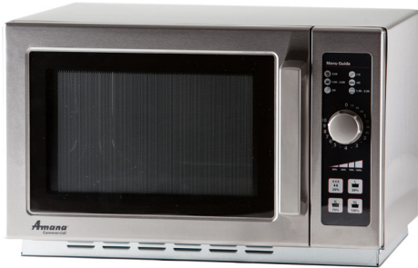
Model RCS10DSE shown