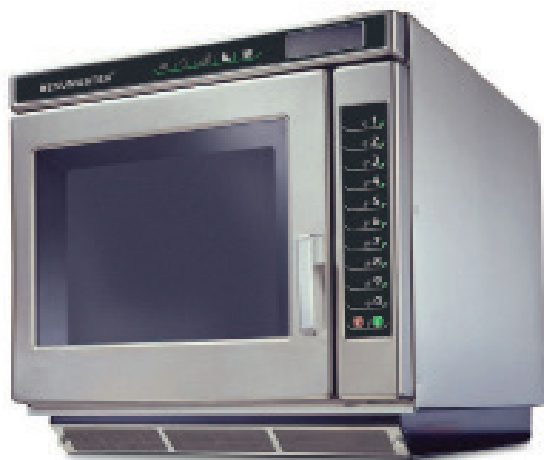
Model MRC30S2 shown